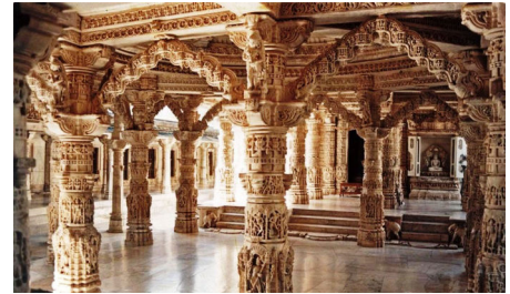
Dilwara Jain Temple